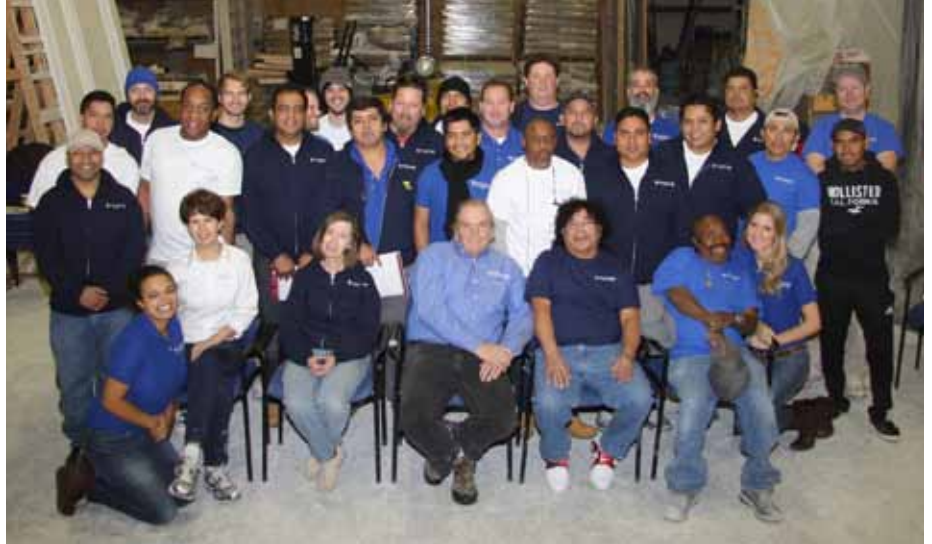
In one of their all-company meetings, Hayles and Howe site artisans join with workshop artisans and office staff for a group photo.