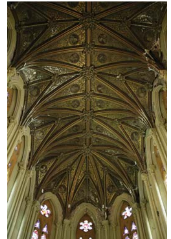
The interior of All Saint's Church before Restoration