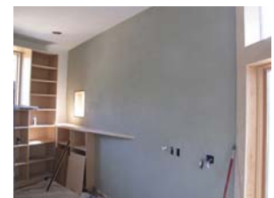
American Clay Plaster