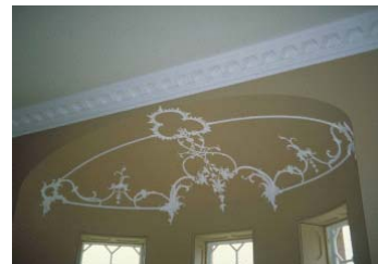
The Dining room at Barlston Hall