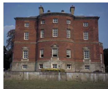
The restored Barlston Hall exterior

* The John Betjeman Memorial Award, SPAB was made to commemorate one of its most famous committee members.