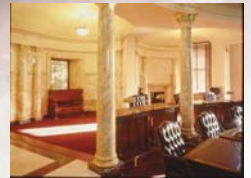
New Jersey Statehouse Trenton, NJ

Hayles and Howe, Inc. offers design, drafting, mouldmaking, running, casting and installation of ornamental plaster; lathing and application of gypsum, clay and acoustic plaster smooth finishes; and design, fabrication, and installation of mazzocco and traditional scagliola. The company specialists are equally comfortable with historic restoration and new design, and they are always available for consulting.