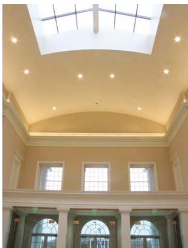
Patrick Henry College, VA U.S.A. BASWaphon vaulted ceiling

its establishment and development in the United States, and looks forward to further expansion in the American market.