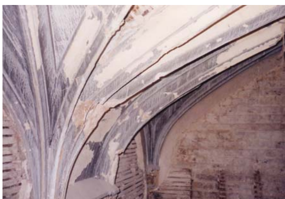
Pictured above is one of fluted ribs in the Equerries Staircase at Windsor Castle which Hayles and Howe restored after the disastrous fire in 1995. The Lime works completed here won Hayles and Howe a regional award from the FPDC in 1998.