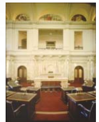
New Jersey Statehouse Trenton, NJ