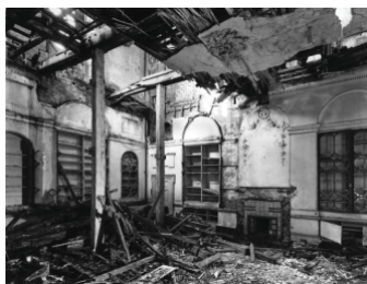
Barlston Library before restoration

reinstated Taylor's ornamental schemes in the entrance hall, library, salon and dining room from clues and vestiges of the historic 18 th century plaster. All original work had to be conserved and embedded in the new work using traditional lime plaster techniques.