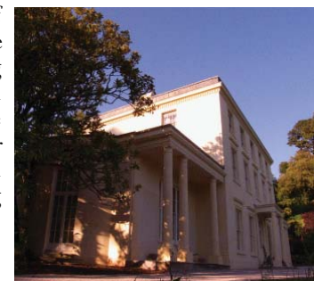
Greenway House on completion of the project

"delightful and virtually undetectable example of rendering restoration"