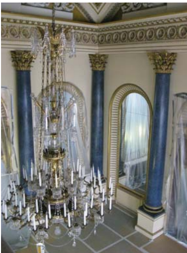
The Music Room - Buckingham Palace