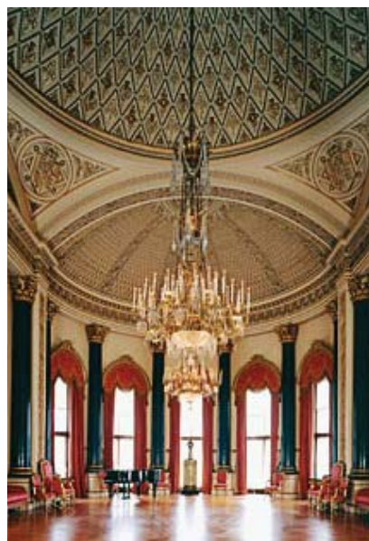
The beautiful Music Room dome at Buckingham Palace showcasing the Lapis Lazuli columns.