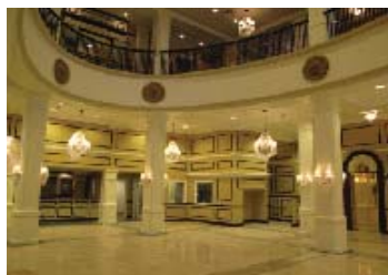
Completed work King Edward's Hotel