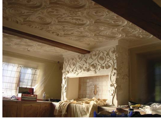
Work at Bents House as it neared its successful completion

building especially on the ornamental stone and lead work on the downpipe collection hoppers.