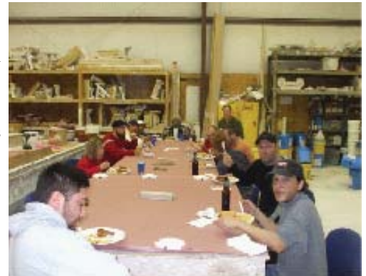
Pictured right is the Baltimore workshop party

Everyone enjoyed relaxed conversation, good food and the occasional game of ping-pong. The ping pong table was set up on one of the running benches.