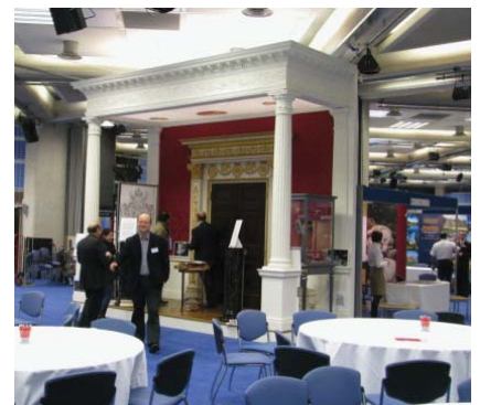
The Stand complete at the start of the Exhibition

Everyone involved was pleased with the outcome and we all made some new contacts. Thanks to everyone that visited the stand. It was a great opportunity to showcase the traditional, artistic and technical expertise of Hayles and Howe.