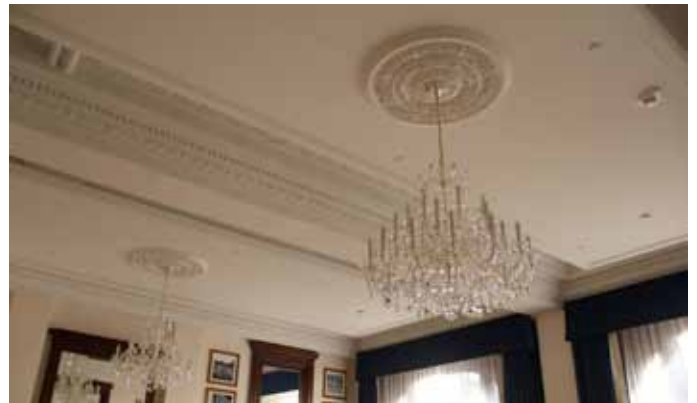
Pictured above: The Presidential Suite: cornices and ceiling roses

Hayles and Howe, Inc. was thrilled to be honored with a contract to work on this project back in December of 2015. The building was the Old Post Office before it was transformed into a hotel. We were asked to work on the corridors, rooms on the fifth floor, the Presidential Ballroom, and the Northwest Ballroom. We installed various cornices and ceiling roses as well as columns inside the ballrooms. The duration of the project was about eight months of vigorously working to ensure the job was completed to the finest. The Trump Hotel opened its doors to visitors in September of 2016.