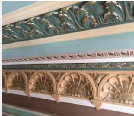
Detail of the Empire Theater loggia box decoration.