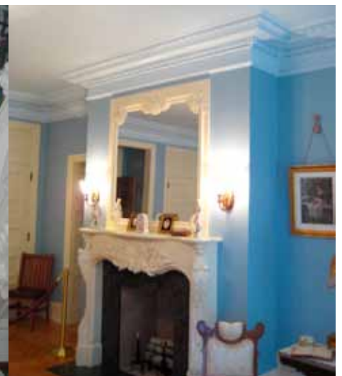
Pictured above are stunning images of the interior of Boldt Castle.

Hayles & Howe Limited Templegate, Mead Rise, Bristol BS3 4RP UK Tel +44 (0) 117 972 7200 Fax +44 (0) 117 971 2232 email: info@haylesandhowe.co.uk