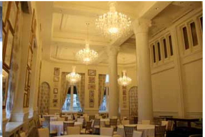
Pictured: The Northwest Ballroom (before and after): Columns, capitals and cornice