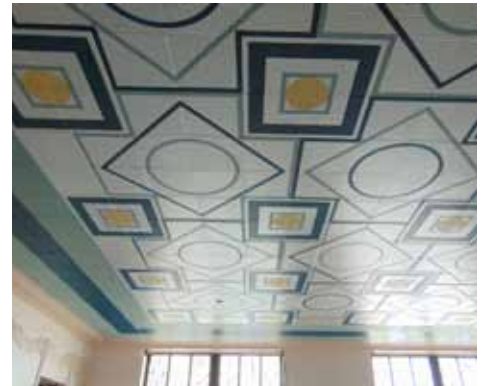
Auditorium of the Halbouty Geosciences Building