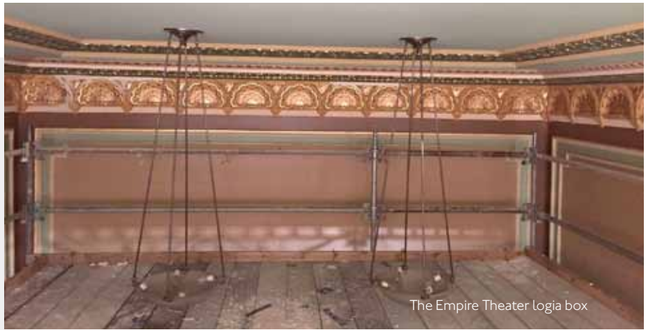
The Empire Theater loggia box

We started to expand our repertoire to painting which allows us more opportunities in our field of work and future jobs. Empire Theater was damaged by water which caused the work previously in the building to break down. We restored the paint and plaster of the auditorium, balcony, and lobby areas of the building. In addition to the restoration work, we had the carpet of the theater installed. We are also working on DAR Constitution Hall in Washington, D.C. We are now working on restoring the paint on the columns and medallions as well as painting the capitals and cornices.